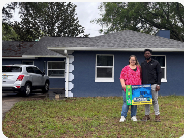
Homeowner stands outside their newly repaired home celebrating completion.