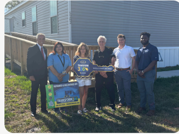
Homeowner proudly receives keys after successful mobile home replacement.