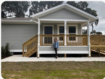
Front view of a recently completed single-family reconstruction project.

Take a look at some of our recently completed Homeowner Recovery Projects.